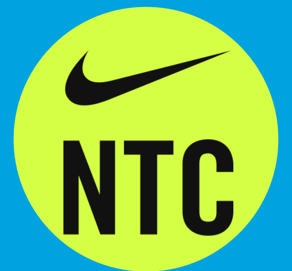
Nike Training Club